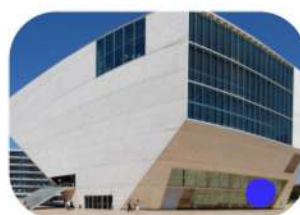
Casa da música

Take the F Metro line to the irregularly shaped building designed by architect Rem Koolhaas. It stands out for its modern lines and the variety of cultural programmes it offers throughout the year. The Casa da Música also offers guided tours. Don't miss the chance to see a live music show in one of its stunning concert halls.